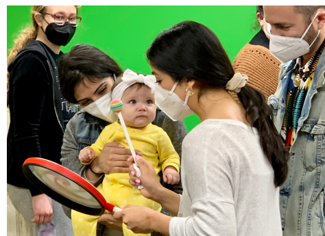
Learning at an early age!