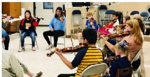
Join the circle