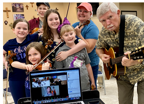
Fiddling fun for everyone!