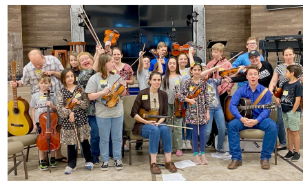
Fiddlepalooza! Workshop in March

Grab your fiddle, or whatever you love to play, for some fiddletastic fun! This fiddle jam session (mostly on the first Friday of each month) is open to everyone of all ages, all levels of experience, and all instruments. We welcome violin, fiddle, viola, cello, bass, guitar, mandolin and more! If you can play it, come join our circle. We are jamming Texas-style sometimes with a little Western Swing for fun, just like Bob Wills did, Deep in the Heart of Texas. We'll Boil The Cabbage, and take a spin to Tennessee Waltz with L'il Liza Jane before we get those Milk Cow Blues and have to head on home.