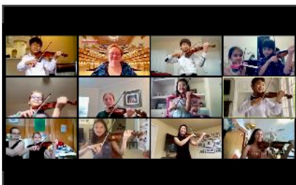
Solo recitals and group concerts