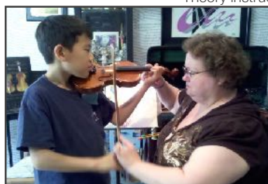
Expert teaching by highly trained teachers