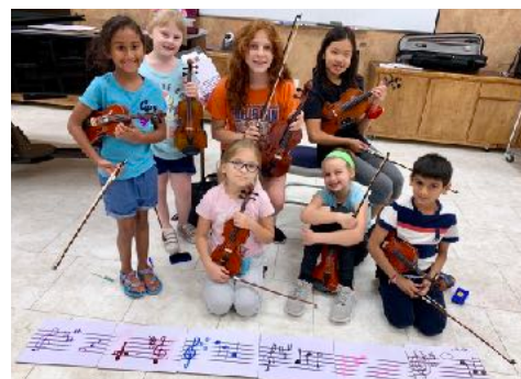
Theory instruction and group classes