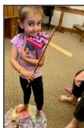
From the start