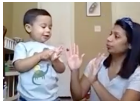
We are learning to count!