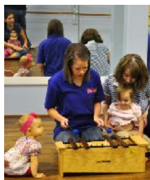
We learn by observing!