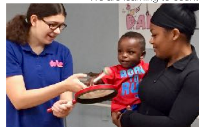
We can keep a steady beat!

Join us once a week for a one-hour class where you will sing, dance, play instruments and enjoy a magical musical experience with your child! Our classes, held weekly, are open to babies & toddlers ages 0 through 4 years and their parents and/or caregivers.