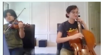
Cellos can fiddle too!