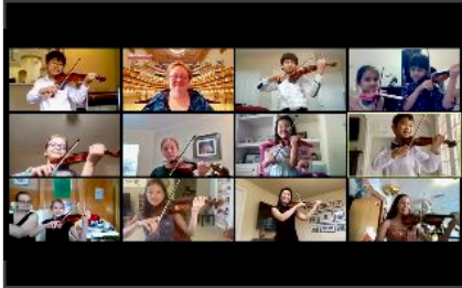
Solo recitals and group concerts