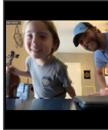
With parent support