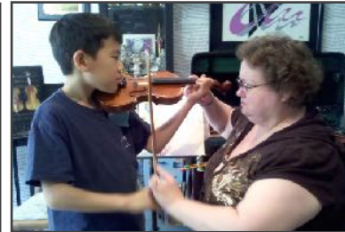
Expert teaching by highly trained teachers