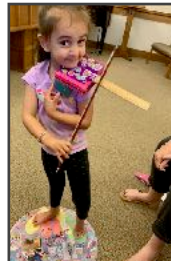
From the start