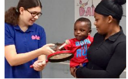
We can keep a steady beat!

Join us once a week for a one-hour class where you will sing, dance, play instruments and enjoy a magical musical experience with your child! Our classes, held weekly, are open to babies & toddlers ages 0 through 4 years and their parents and/or caregivers.