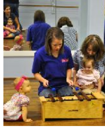
We learn by observing!