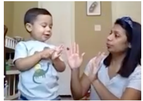
We are learning to count!