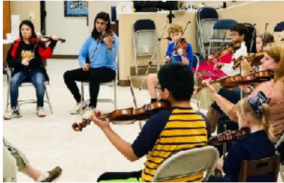
Join the circle