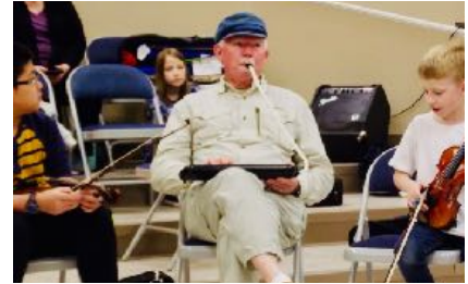
All instruments are welcome! Even melodical!

Grab your fiddle, or whatever you love to play, on the first Friday of the month (most months) for some fiddletastic fun! This fiddle jam session is open to everyone of all ages, all levels of experience, and all instruments. We welcome violin, fiddle, viola, cello, bass, guitar, melodica and more! If you can play it, come join our circle. We are jamming Western Swing style, just like Bob Wills did, Deep in the Heart of Texas. We'll Boil The Cabbage, and take a spin to Tennessee Waltz with L'il Liza Jane before we get those Milk Cow Blues and have to head on home.