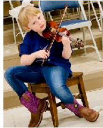
Wear your boots