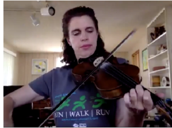
Learn some new tunes