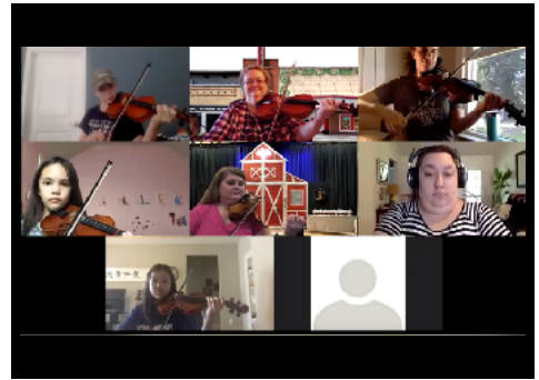
Zoom in from anywhere