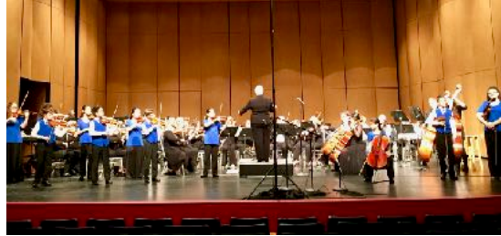
On stage with the Fort Bend Symphony Orchestra