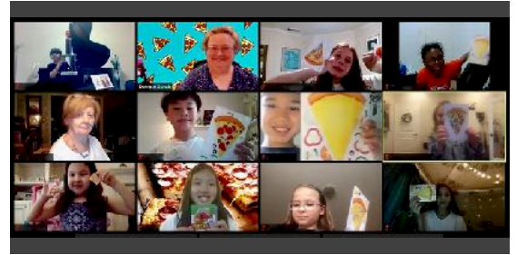
1000 Days of Practice Pizza-Party Online Group Class

please use a separate form for each student