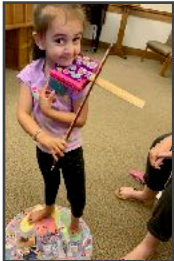
From the start