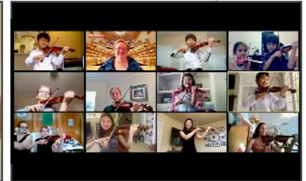
Solo recitals and group concerts