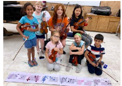
Theory instruction and group classes