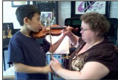
Expert teaching by highly trained teachers