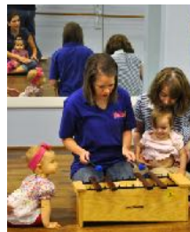
We learn by observing!