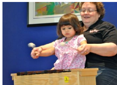
We can sing and play the xylophone!