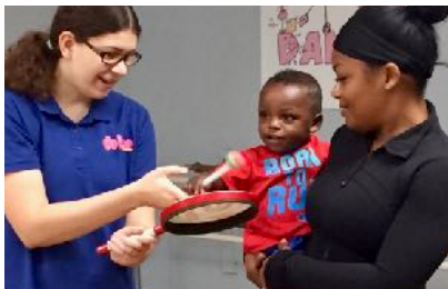
We can keep a steady beat!